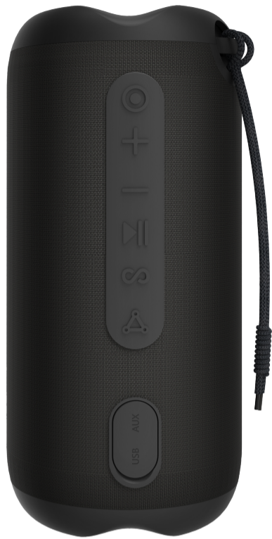
SHARK S1 WIRELESS PORTABLE SPEAKER USER MANUAL